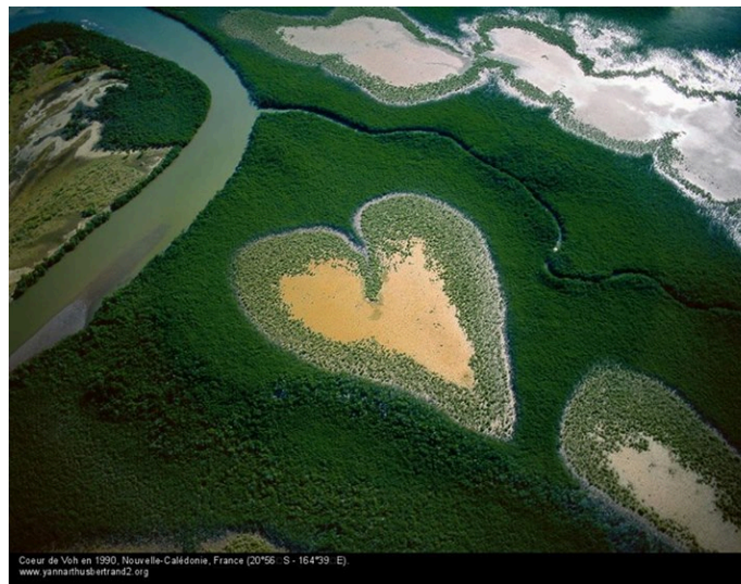
Coeur de Voh en 1990, Nouvelle-Calédonie, France (20°56' S - 164°39' E).