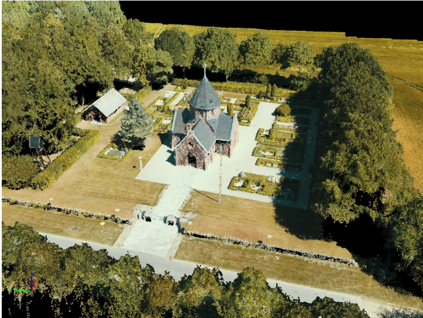
Sted og dato Dias 8