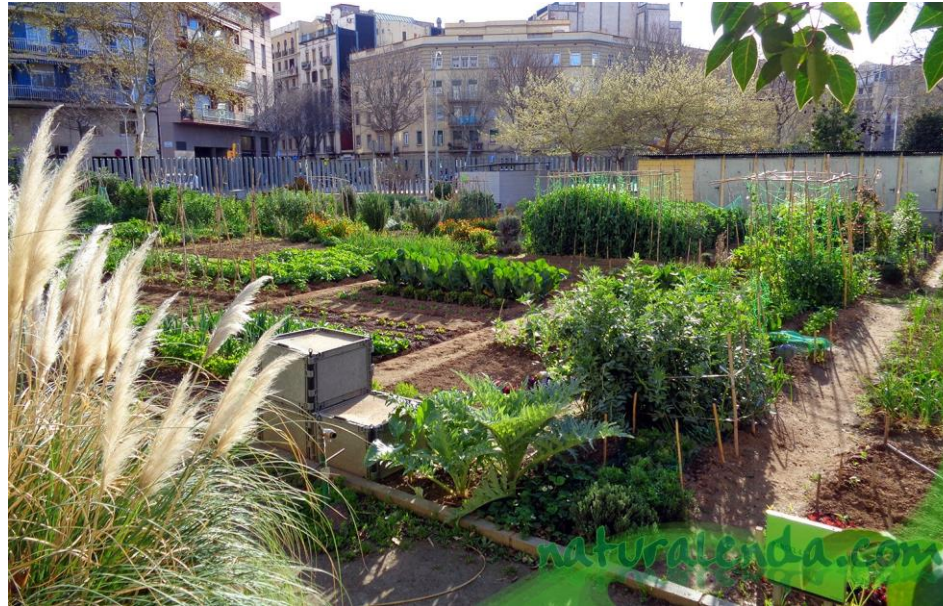
Video with link: (english/Spanish)